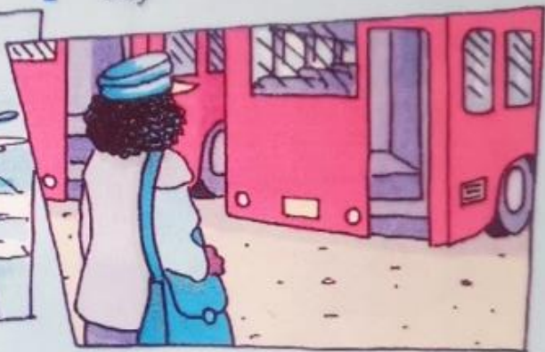
4 go to