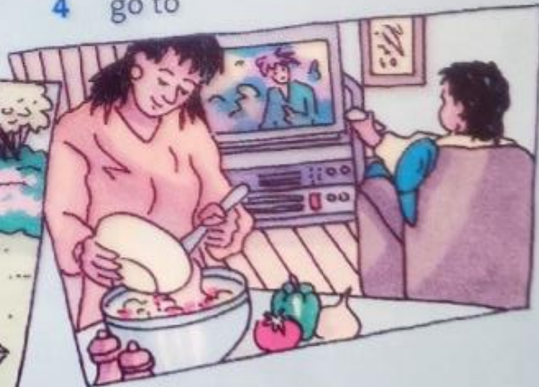
6 make; watch TV