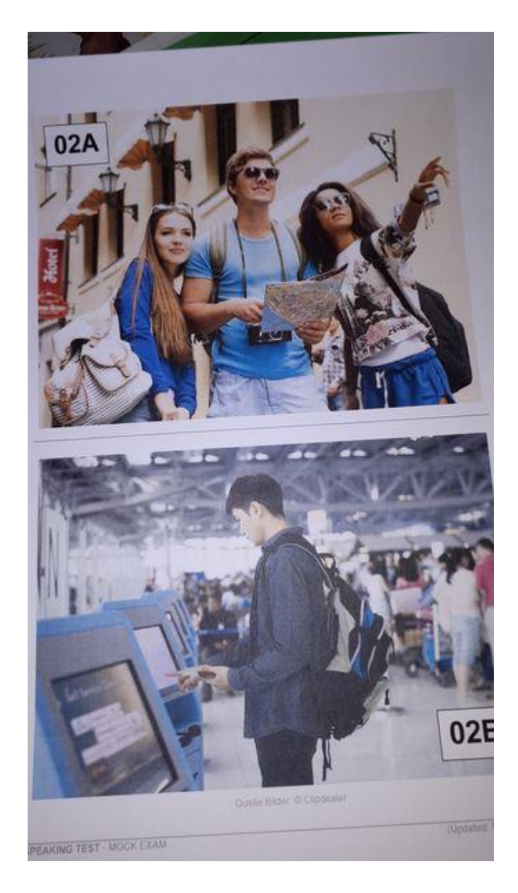
C) Speaking Part III